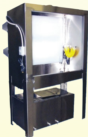
4 x 4 Stainless Steel Recirculating Booth

Card excessive ink from the screen. XL INK WASH can be continuously recirculated until product becomes too heavily soiled with solids. Used product may be filtered and reused.