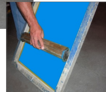
Step 2. Squeegee Side