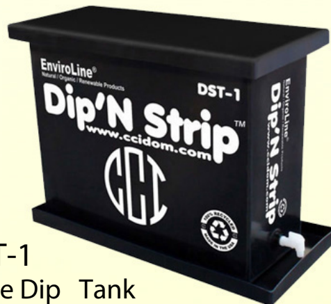
DST-1 Polyethylene Dip Tank

Add Gem-zyme to Dip Tank and fill with appropriate amount of water. UP TO 20 PARTS WATER. Place screens in dip tank and let dwell for a few minutes. Only let screens soak until emulsion is soft enough to be rinsed off. Emulsion should not come off in dip tank.