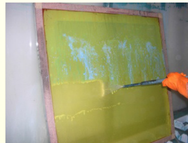
Step 3. High pressure rinse - starting at bottom.