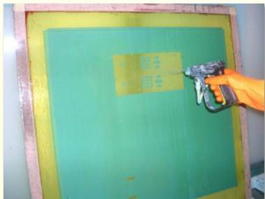
Step 1. After removal of ink, block-out, and tape, apply GEM-ZYME to a wet screen(both sides).

GEM-ZYME can be used in concentrated form, or it can be diluted up to 1 to 20 parts of water.