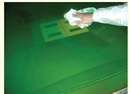
Step 3 . Use rags or towels to wipe up ink residue. Re-apply to clean up ink residue in image area.